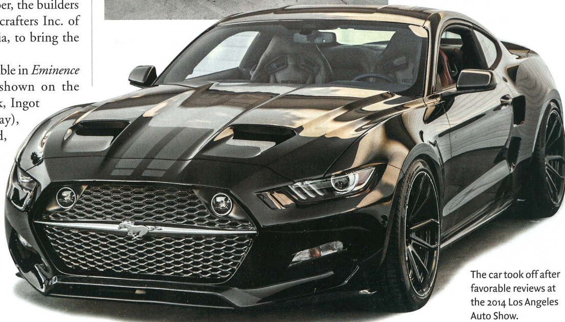
The car took off after favorable reviews at the 2014 Los Angeles Auto Show.